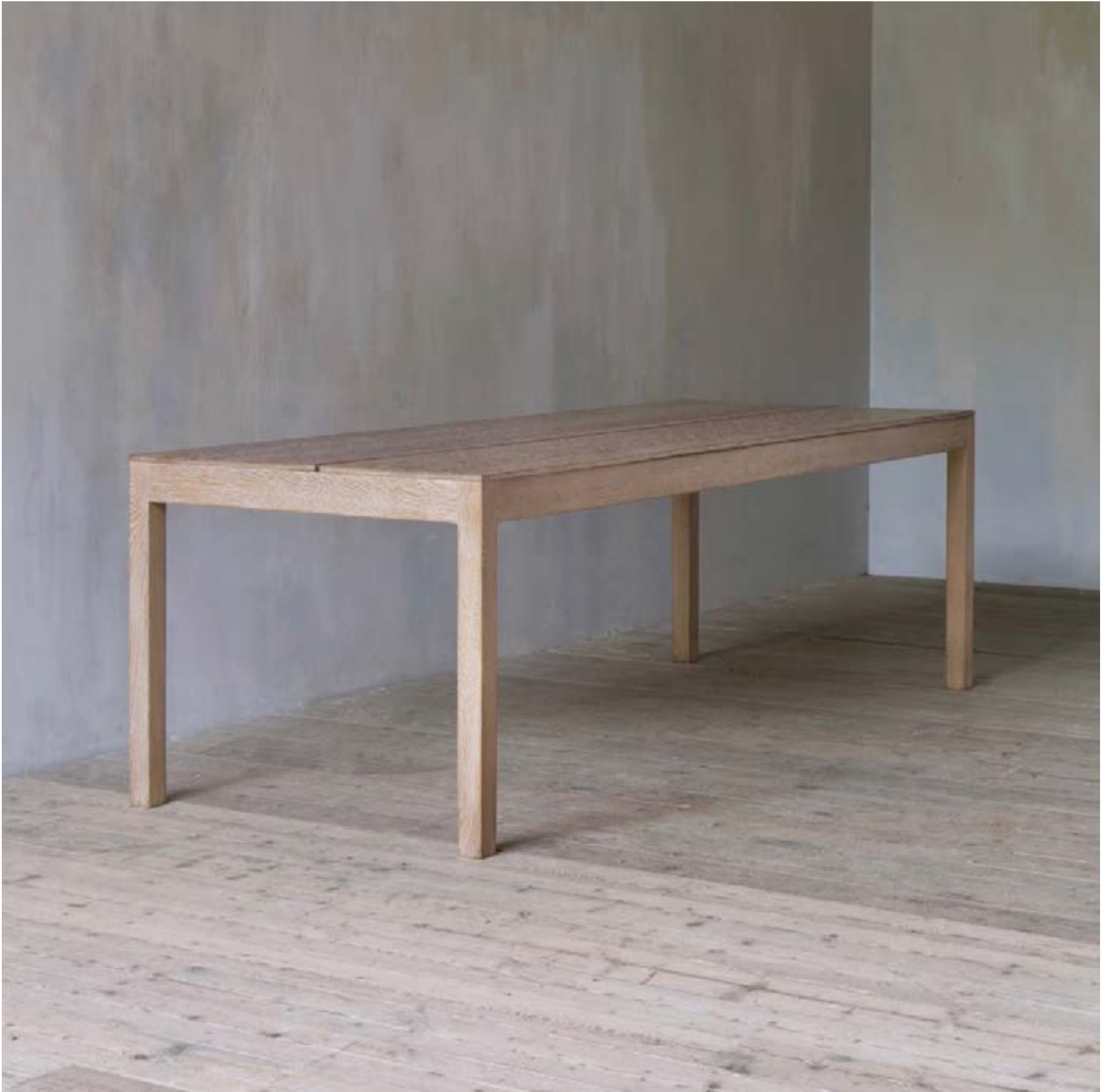
The articulate table in oak | whitewash (oiled)